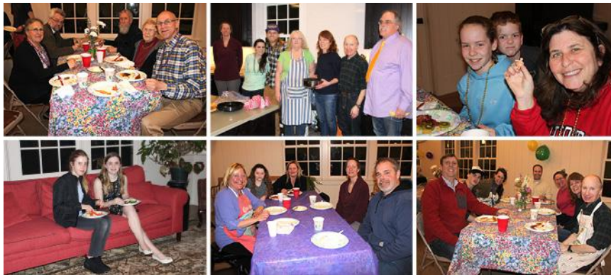
Square Dance at Chase Meadows Farm